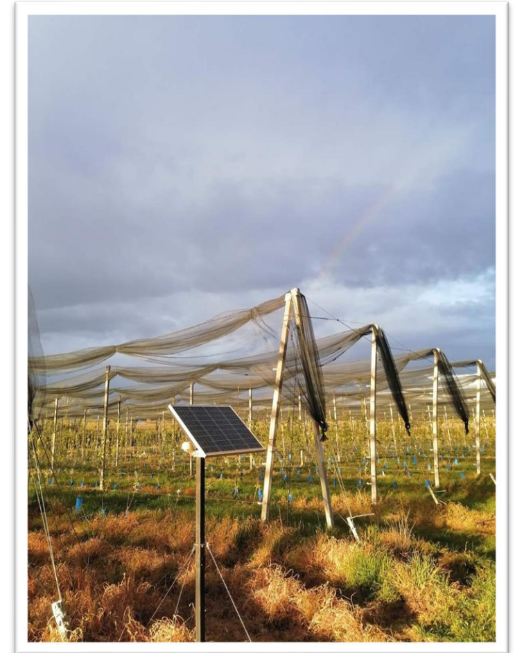
Commercial plot in Agia Marina, Veria