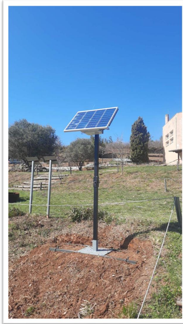
Balkan Botanical Garden of Kroussia, Kilkis

Both locations offer an ideal environment for testing climate adaptation technologies, hosting a rich diversity of plant species or climate sensitive crops, such as peach trees.